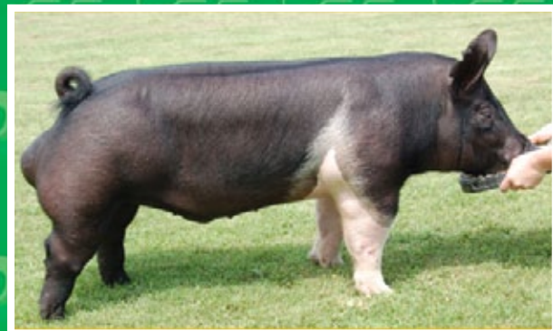
Perfect Remedy (Top Cut Genetics) (Super Monster x Super 7 x 7-2)