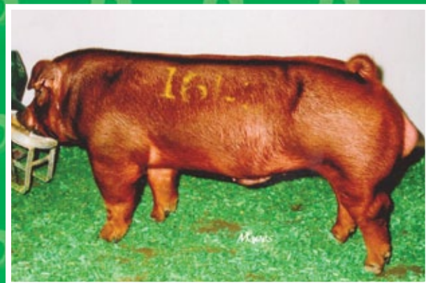
Cool Stuff (RAR Genetics) (DCM7 Freakshow 54-1 [Showboats littermate] x Sue SR 69-11 [Dynamite x Simply Red 69-11]) Class winner at the 2011 SWTC.

Purchased by RAR Genetics. For a video of this boar visit www.rargenetics.com .