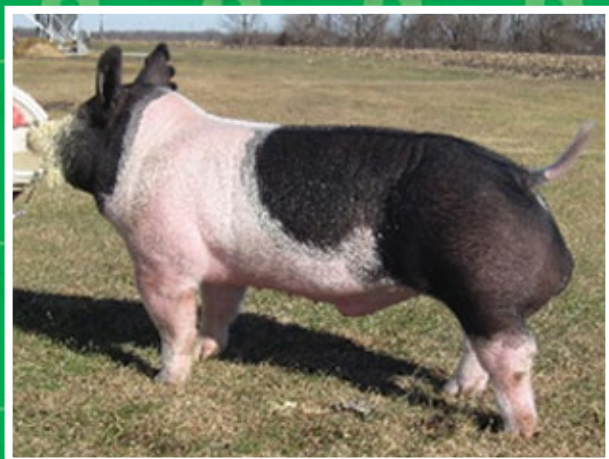
Rehab (RAR Genetics) (Bang This x Bulletproof)

Purchased by RAR Genetics. For a video of this boar visit www.rargenetics.com .